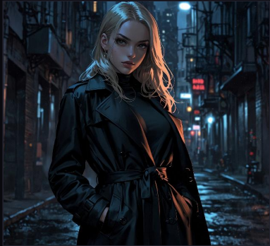
CARMILLA GRIEVING MATRIARCH

Centuries-old vampire hiding in the city's underground district. Consumed by immense regret for alienating her daughter Ophelia, she attempts to run from her past via a hospital job. Forced into a corner by Vex, she must protect a new fledgling and form an army.