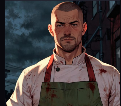
VEX VORDENBURG ARROGANT ZEALOT

An isolated alternative youth looking for belonging within the city's gothic community. Naive to the actual horrors of the night, she romanticizes the dark until she is caught in a militia shootout. Her sudden transformation forms the heart of the series.