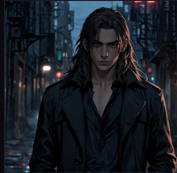
REMI DRAMATIC CONFIDANT

Centuries-old vampire hiding in the city's underground district. Consumed by immense regret for alienating her daughter Ophelia, she attempts to run from her past via a hospital job. Forced into a corner by Vex, she must protect a new fledgling and form an army.